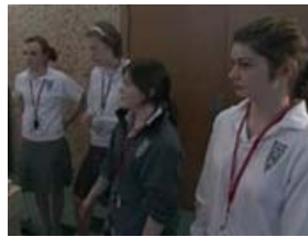
1 of 1 Click to enlarge