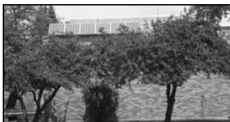
The solar panels are located on the roof facing south near the Music Department.

BP's A+ for Energy program was created to recognize innovative energy education activities in the classroom. Awardees receive a grant to implement their program, a full scholarship to attend a three-day Energy Educator Training Conference, and a Science of Energy kit and other classroom materials valued at $500.